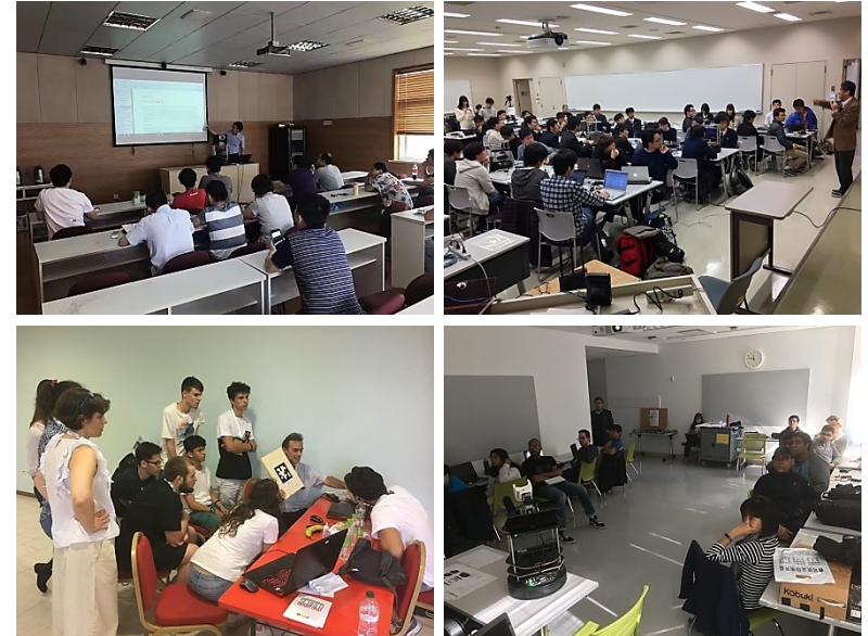
Fig. 2 Outreach programs including workshop and competition activities in China, Japan, USA and Italy (clockwise from top left)